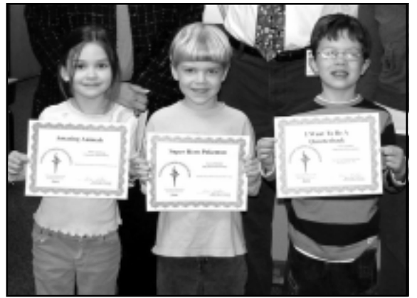
Three elementary school students get their awards entitled "Amazing Animals," "Super Hero Pokemon," and "I Want to be a Quarterback."